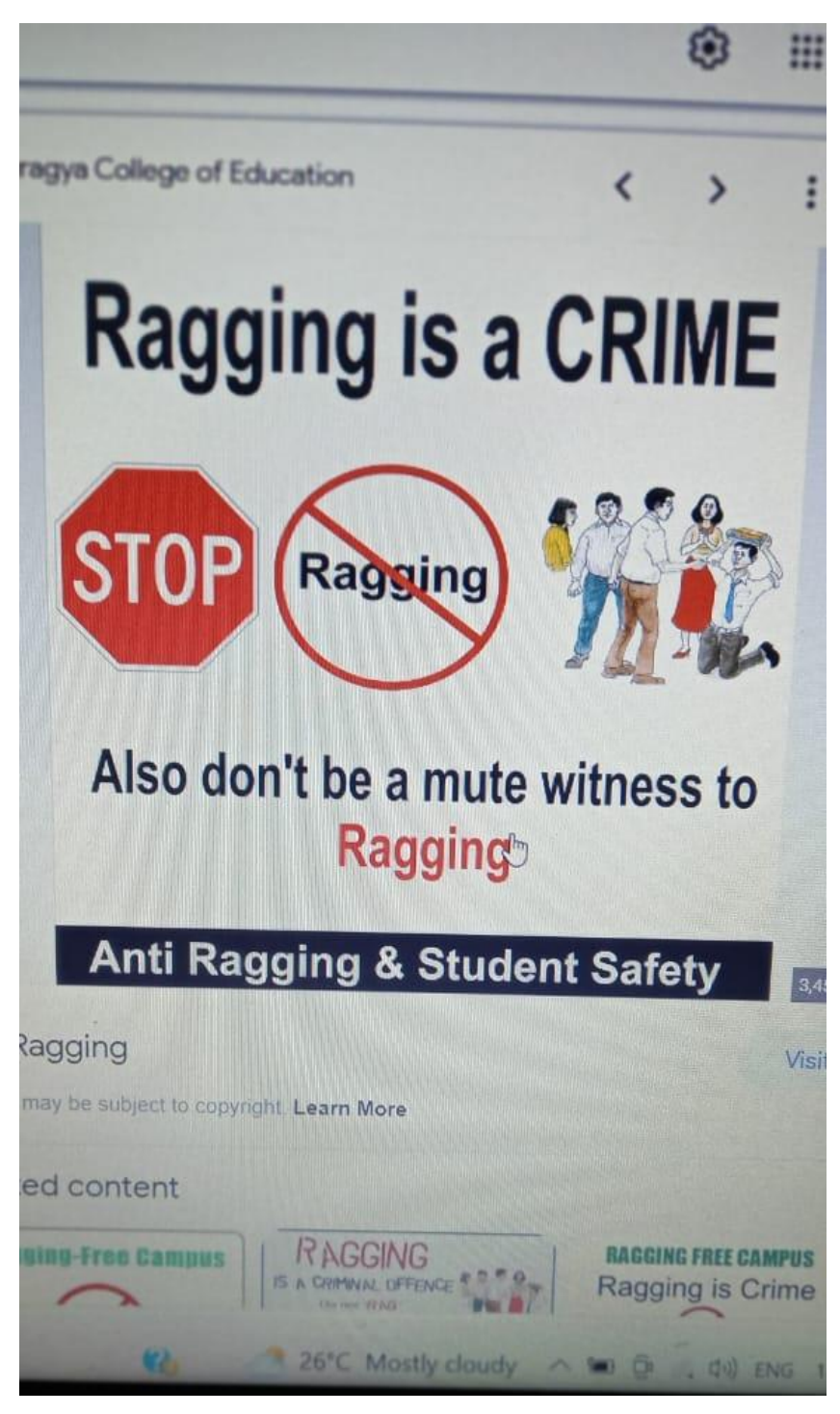
Anti-Ragging Awareness Poster