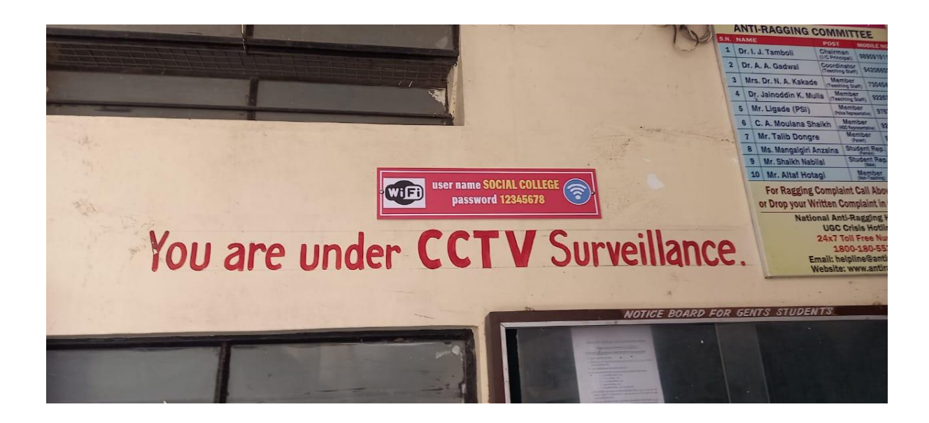
C.C.T.V. Surveillance to catch Ragging incidents